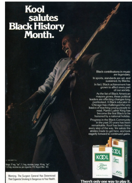
Kool advertisement, 1984

The tobacco companies also recognized the value of associating their brand with popular community events.