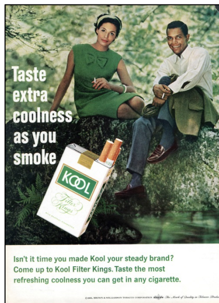
Kool advertisement, 1966

Brown & Williamson took to the airwaves to market Kool, with an advertising budget exceeding that of the other tobacco companies in the 1960s. During this time, cigarette advertisements, many featuring famous black athletes, tripled in Ebony . 7 The aggressive marketing campaign had a huge impact - from just 1968 to 1976, the percentage of Black Americans smoking Kool jumped from 14 percent to 38 percent, with even greater preference for Kool among young African American males. 8 An R.J. Reynolds analyst noted that, “Kool became ‘cool’ and, by the early 1970s, had a 56% share among younger adult Blacks—it was the Black Marlboro.” 9 Salem’s successful initial promotion of